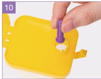
10. Throw the lancet into a sharps container.