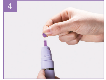
4. Put in a Soft Touch Lancet and screw off the cap.