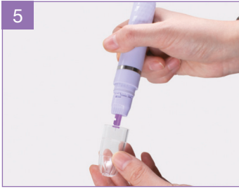
5. Put on the vacuum cap.