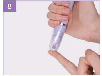
8. Remove the lancing device slowly from sampling site.