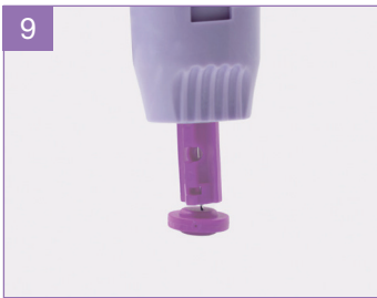
9. Penetrate the lancet into its cap.