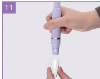
11. Put back the vacuum cap.