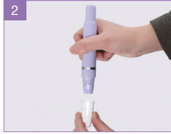
2. Remove the vacuum cap.