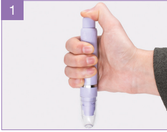
1. Push the top button.