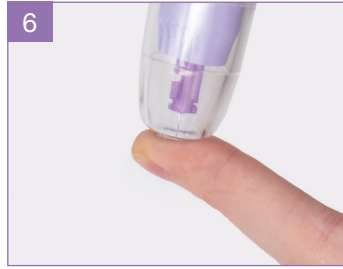
6. Place the lancing device tightly on the blood collection area.