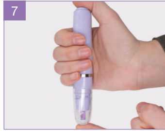
7. Push the top button and release it quickly.