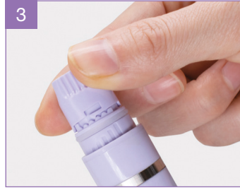
3. Rotate the dept adjuster to the appropriate position.